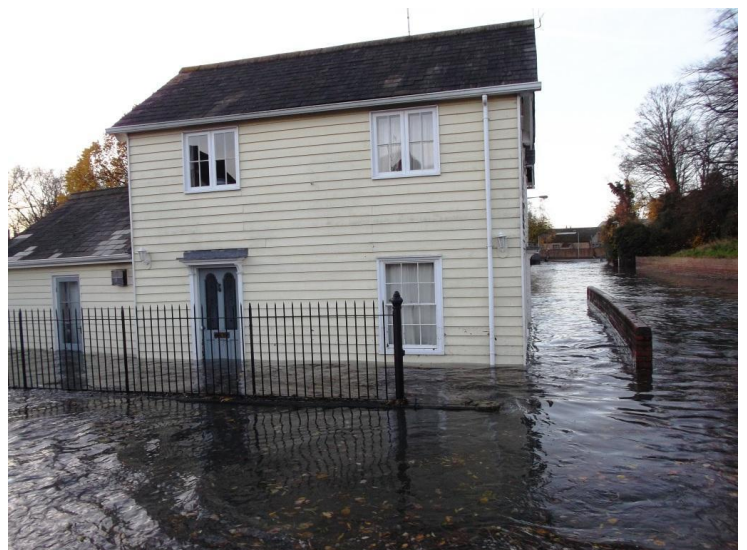
Front Brents Faversham, 2013